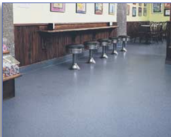
Ice Cream Parlor